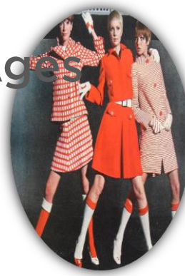
SWINGING SIXTIES c. 1960s