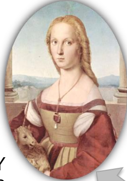
RENAISSANCE ITALY c. 1400-1700