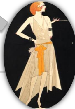
ROARING TWENTIES c. 1920s