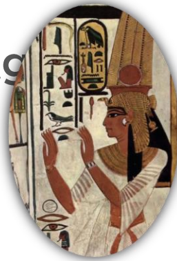
ANCIENT EGYPT c. 1292-1069 B.C.