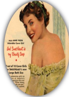
GOLDEN AGE HOLLYWOOD c. 1930s-1950s