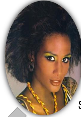
SUPERMODEL ERA c. 1980s