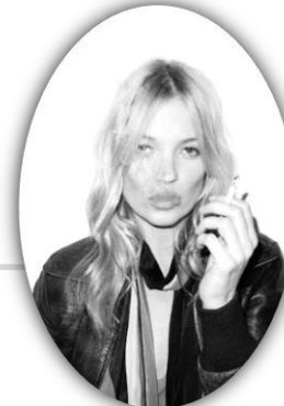
HEROIN CHIC c. 1990s