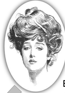
EDWARDIAN c. 1837-1901