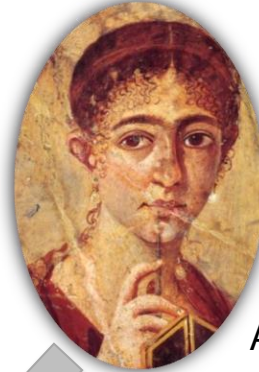
ANCIENT GREECE c. 500-300 B.C.