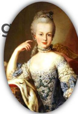
18 th CENTURY FRANCE c. 1700s