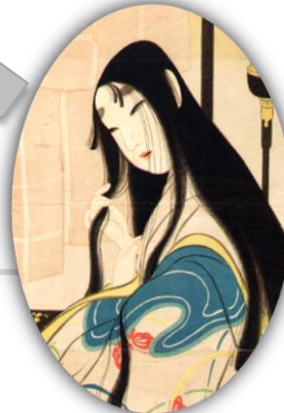
HEIAN JAPAN c. 794-1185